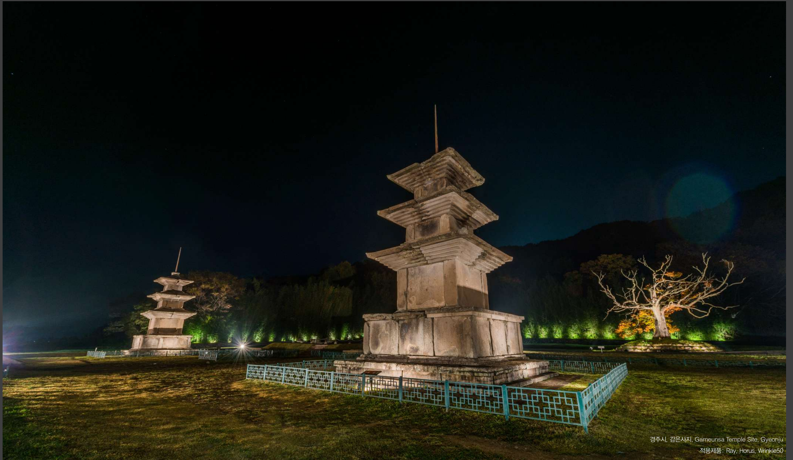
경주시, 감은사지, Gameunsa Temple Site, Gyeongju 적용제품: Ray, Horus, Winkle50