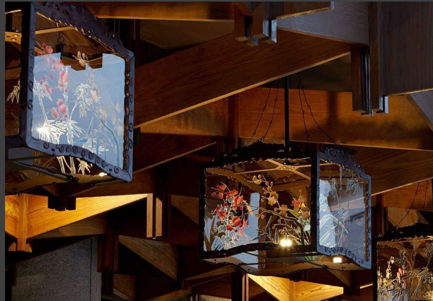
국립고궁박물관 Custom-made, National Palace Museum of Korea, Seoul