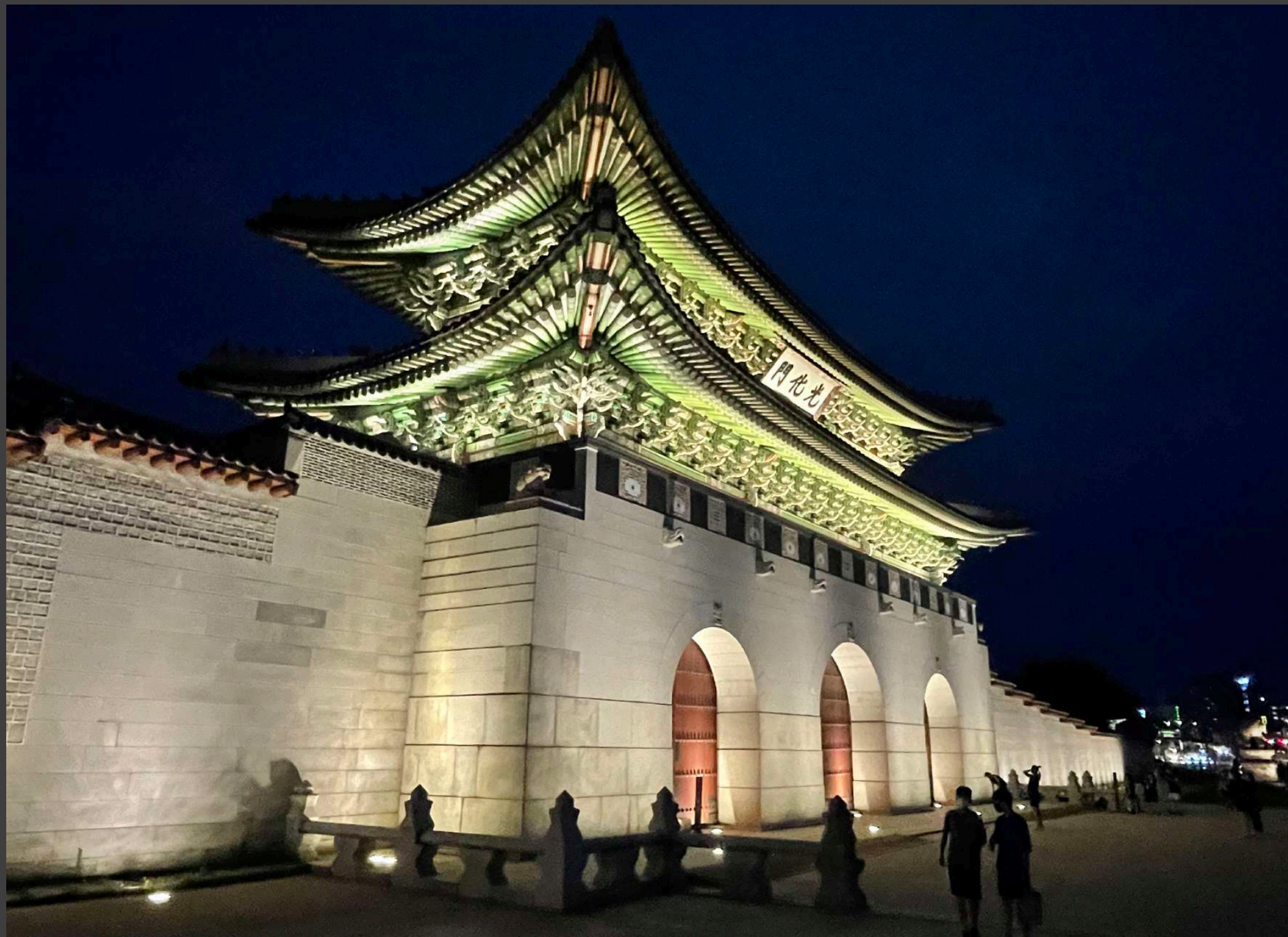
서울특별시, 광화문, Gwanghwamun, Seoul