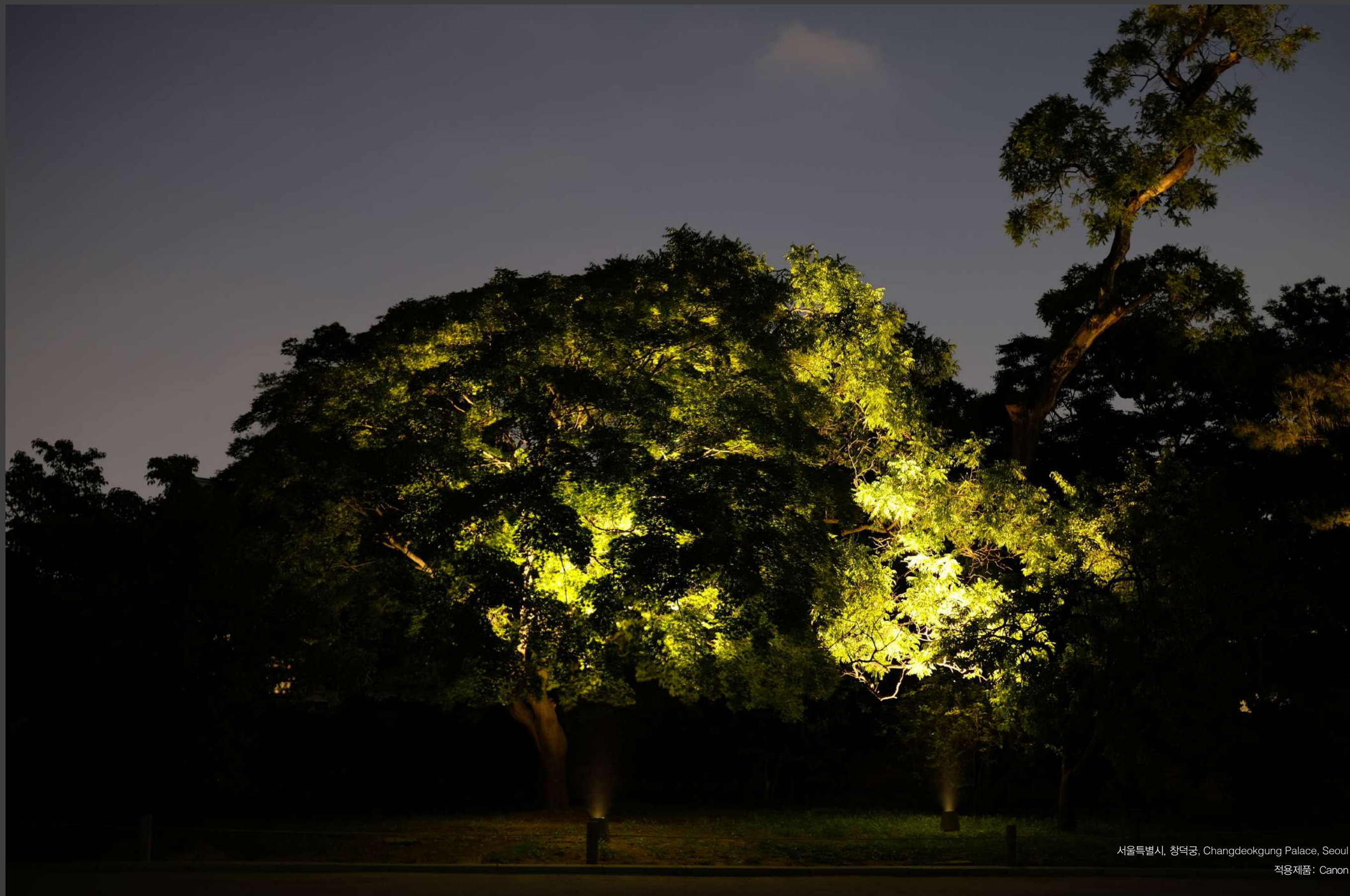
서울특별시, 창덕궁, Changdeokgung Palace, Seoul 적용제품: Canon