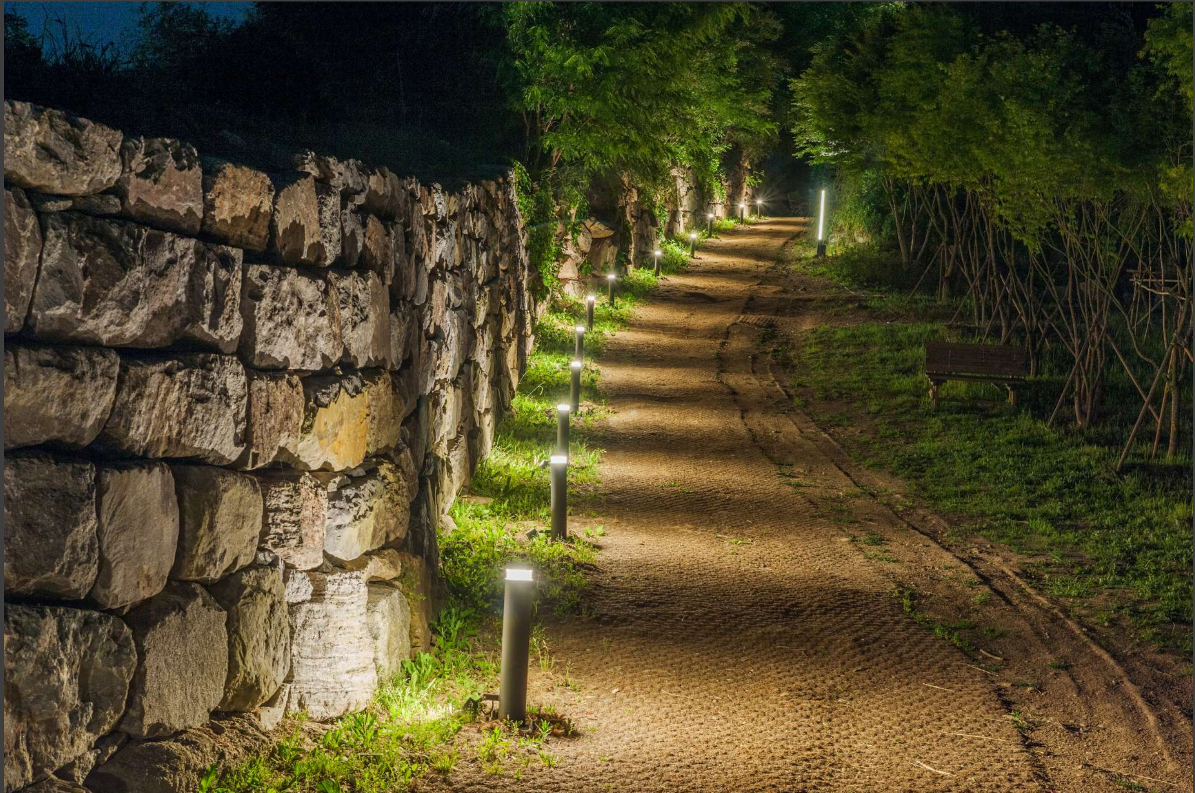
공세리성당, Catholic church, Asan-Si 적용제품: PP20