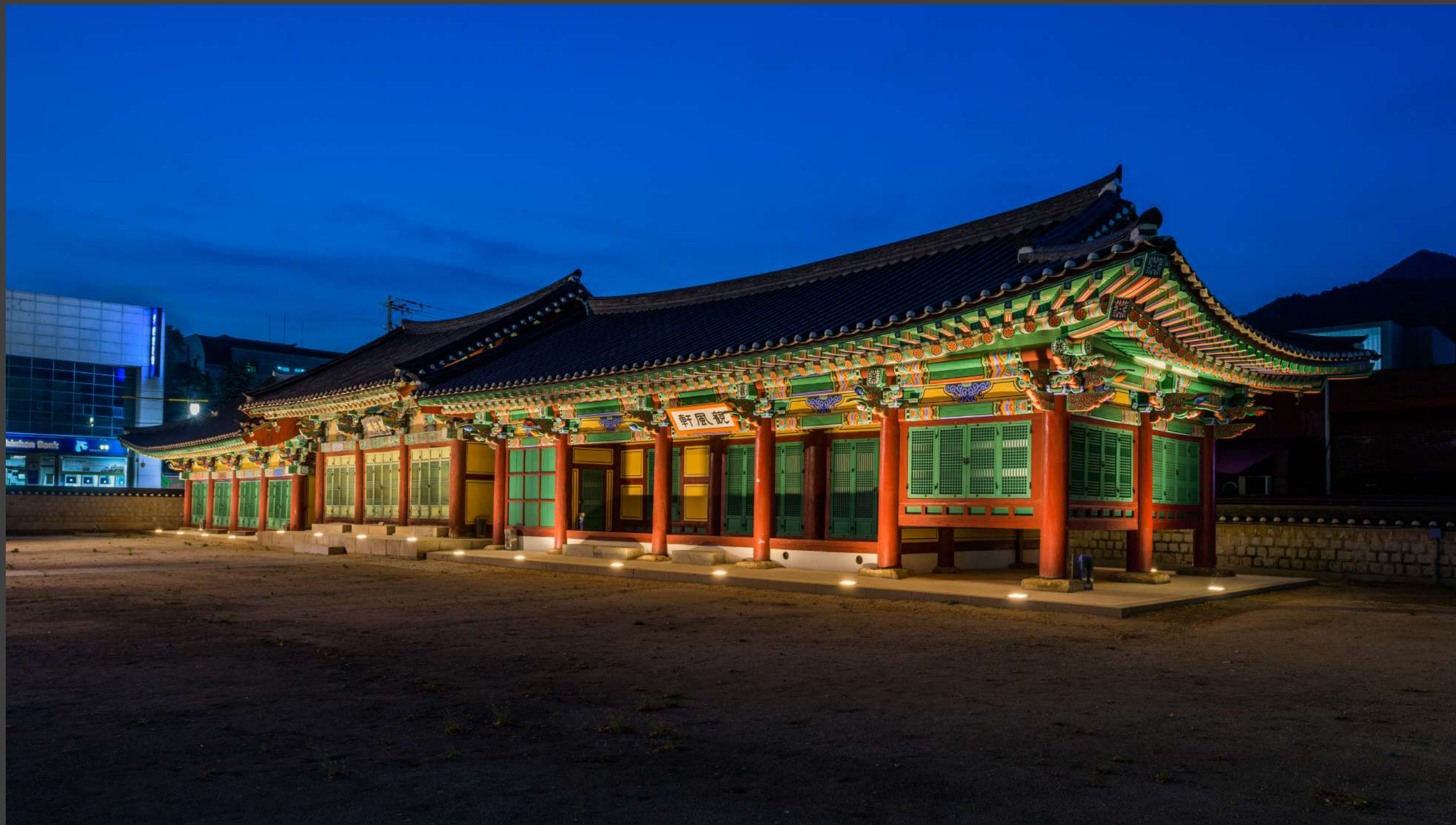
영월부관아, Old government Office, Youngwol-gun 적용제품: NAU-SQ, Wrinkle-MP