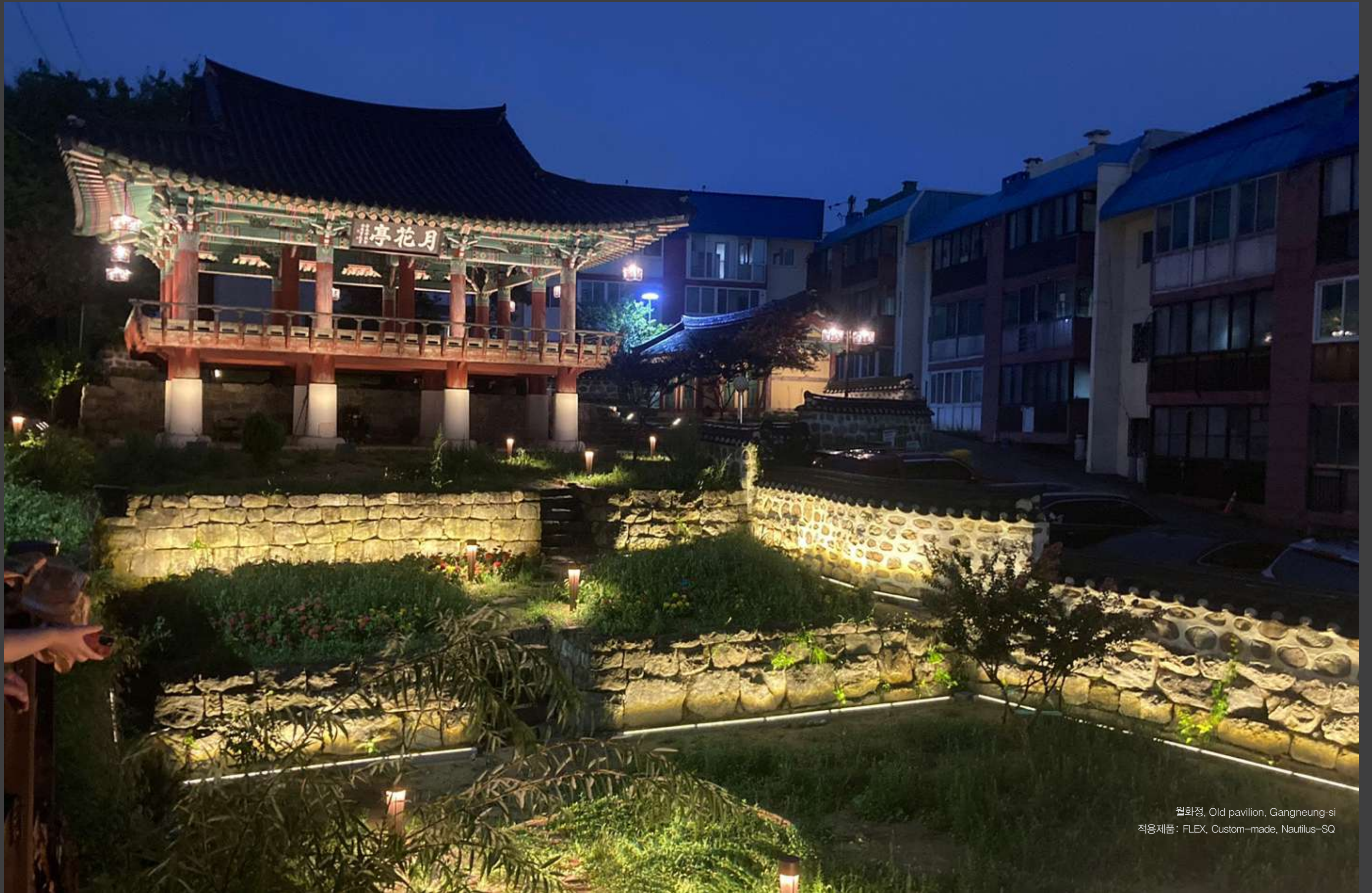
월화정, Old pavilion, Gangneung-si 적용제품: FLEX, Custom-made, Nautilus-SQ