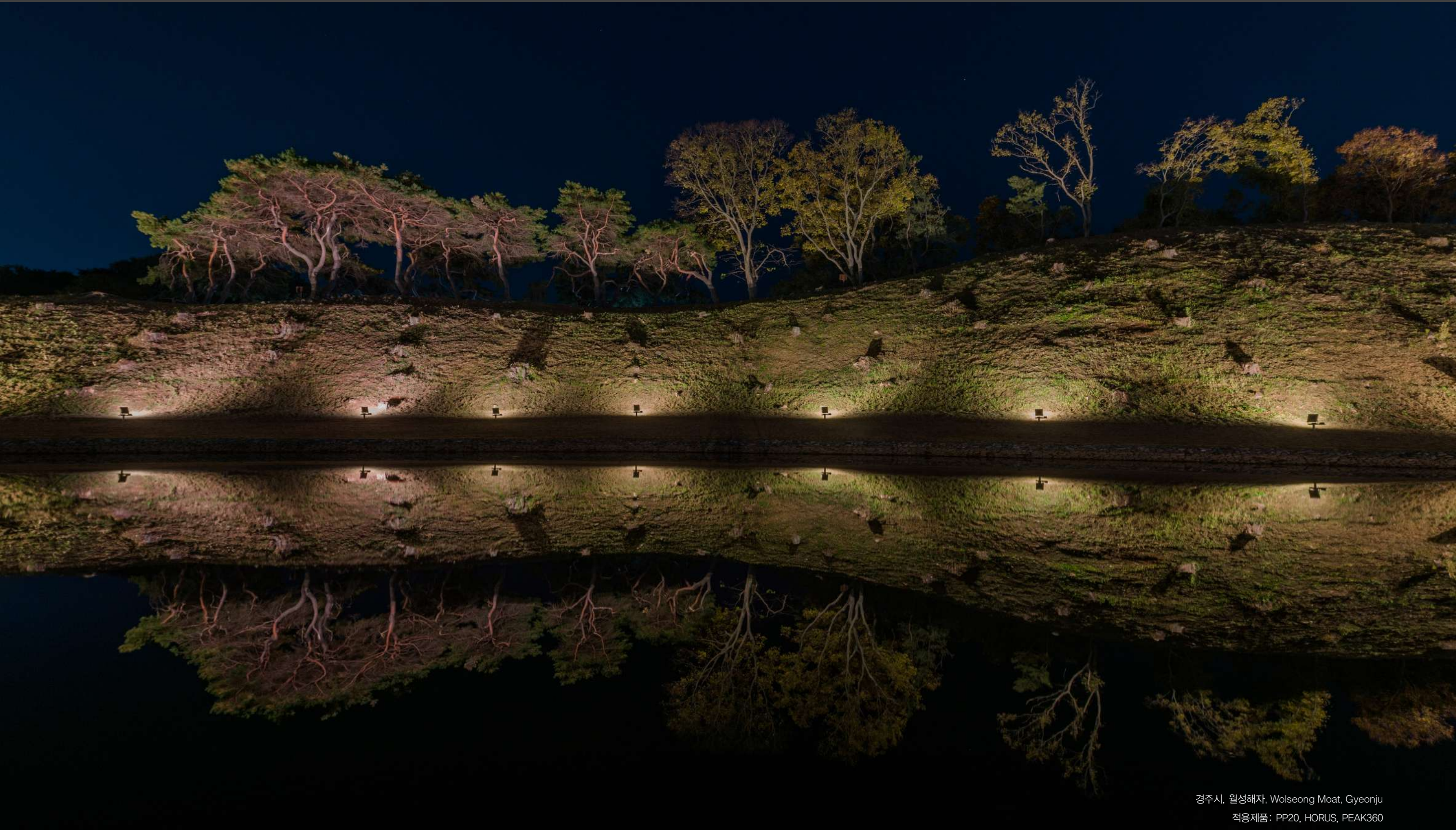
경주시, 월성해자, Walseong Moat, Gyeongju 적용제품: PP20, HORUS, PEA360