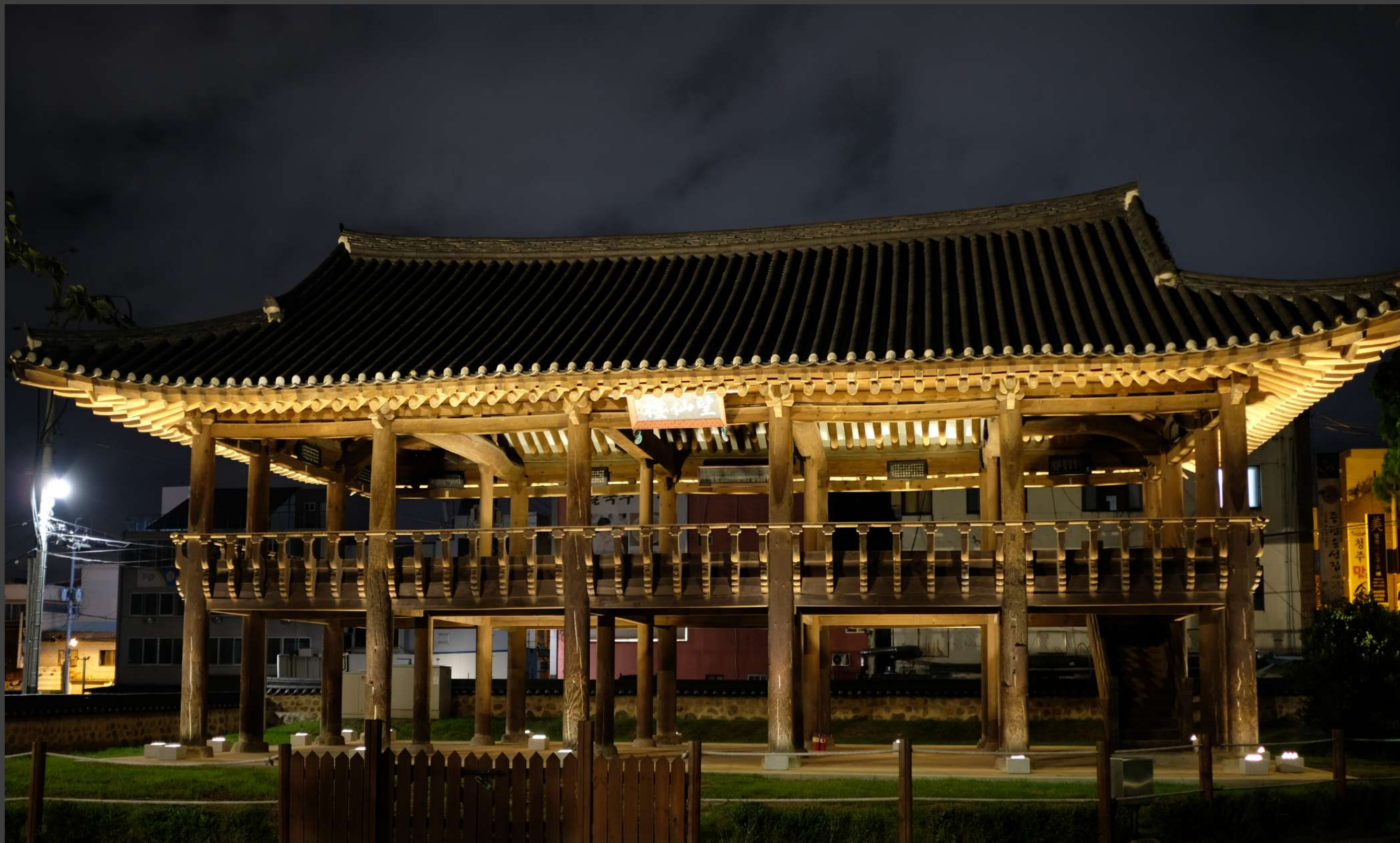
충청도병마절도사, Old pavilion, Cheongju-si 적용제품: Nautilus-SQ