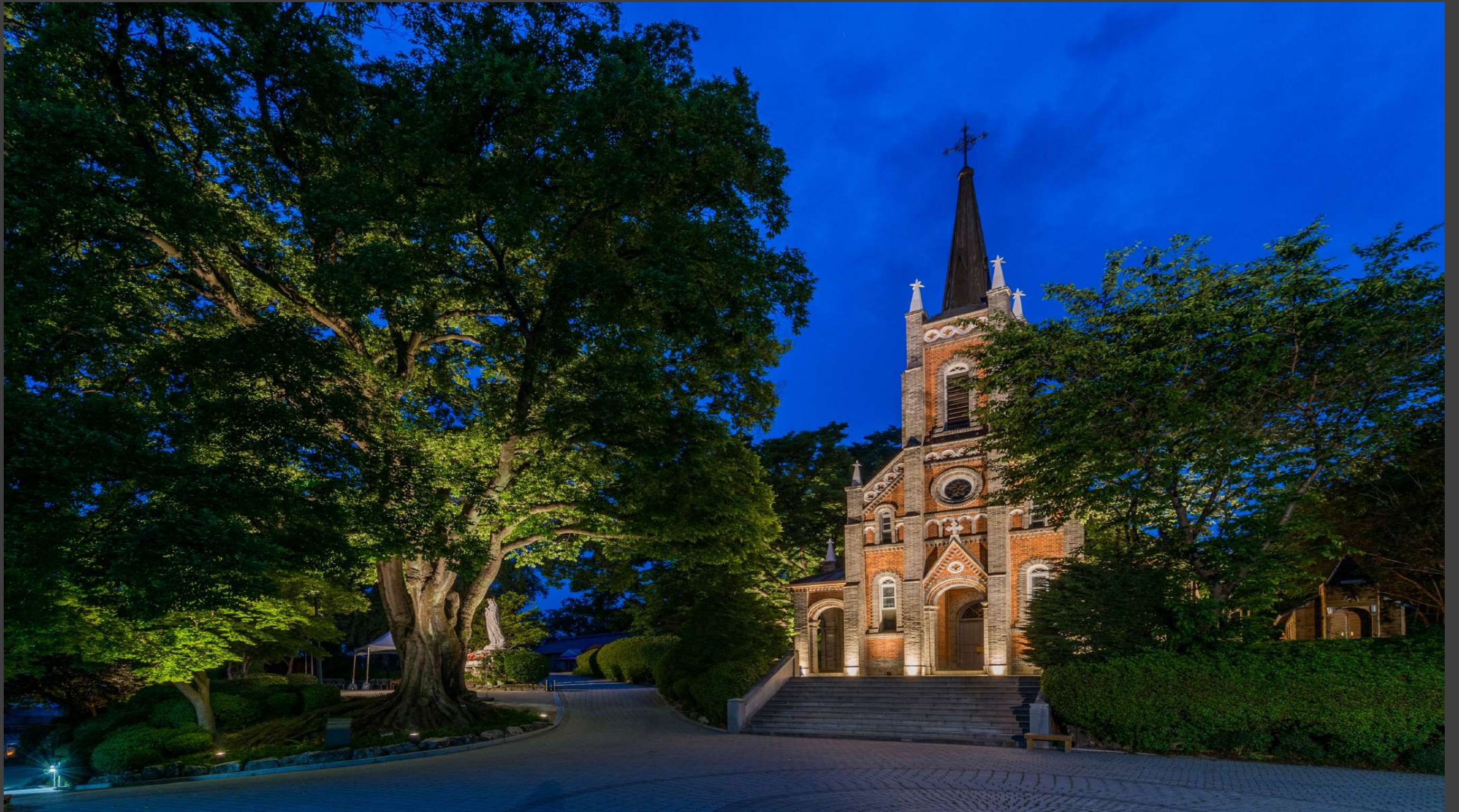
공세리성당, Catholic church, Asan-Si 적용제품: NAU-SQ, FLEX, PEAK, STEM