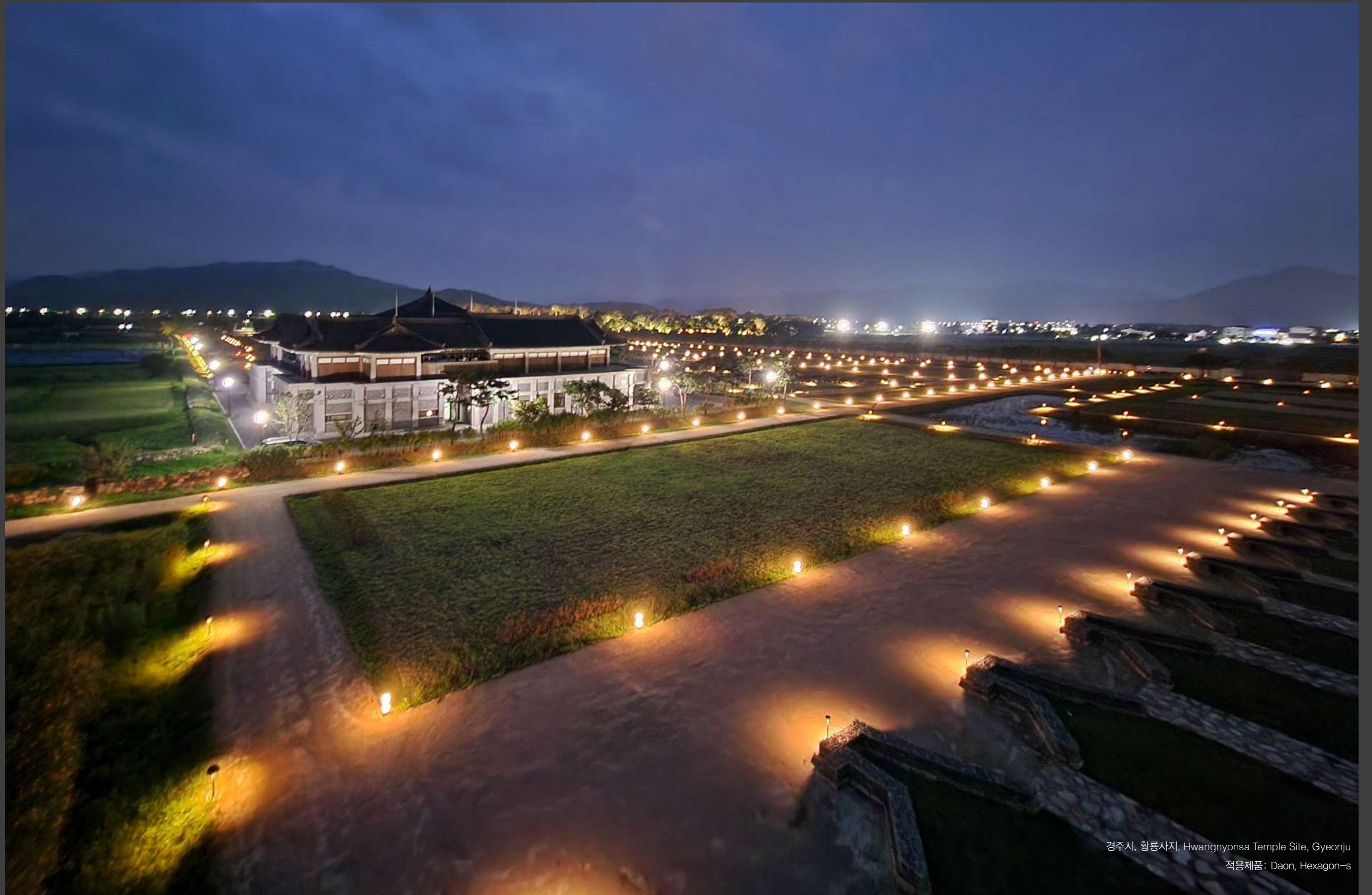
경주시, 황룡사지, Hwangnyonsa Temple Site, Gyeongju 적용제품: Daon, Hexagon-s