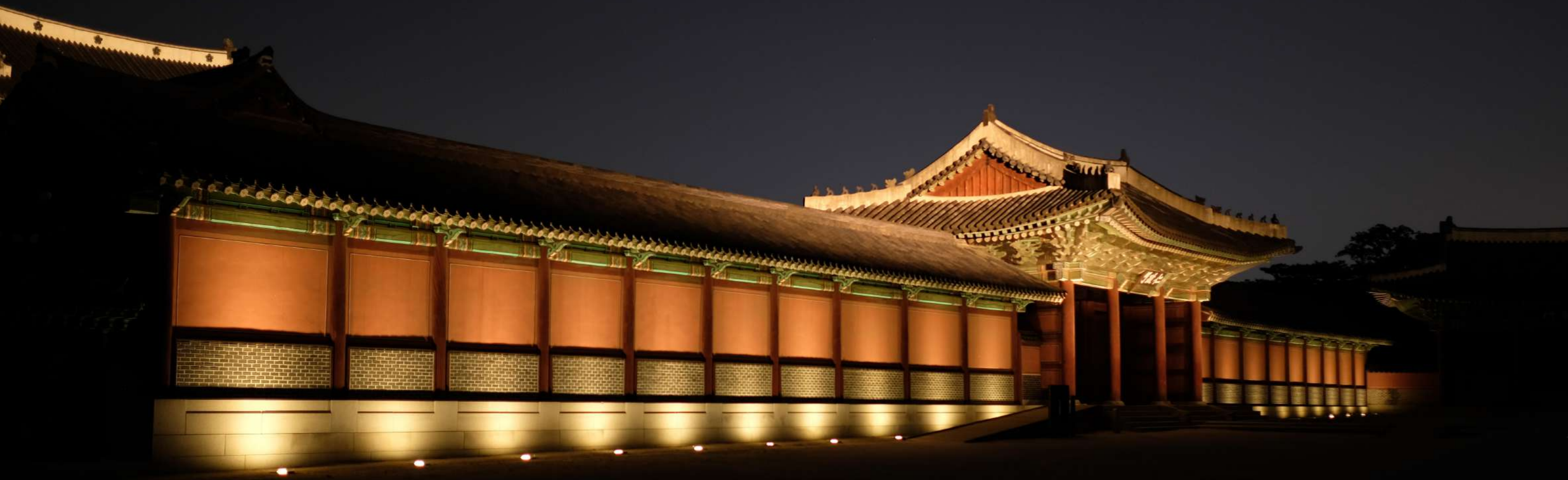
서울특별시, 창덕궁 Changdeokgung Palace, Seoul 적용제품: NAUTILUS-SQ