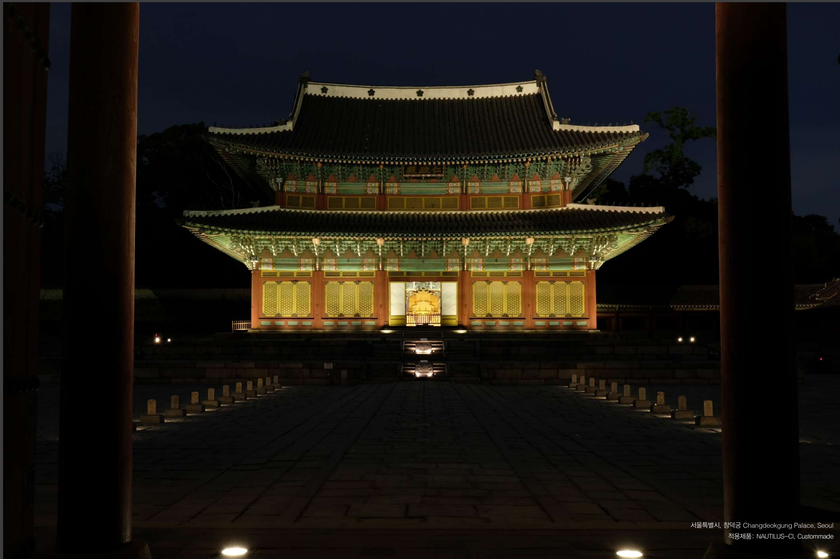
서울특별시, 창덕궁 Changdeokgung Palace, Seoul 적용제품: NAUTILUS-Cl, Custommade