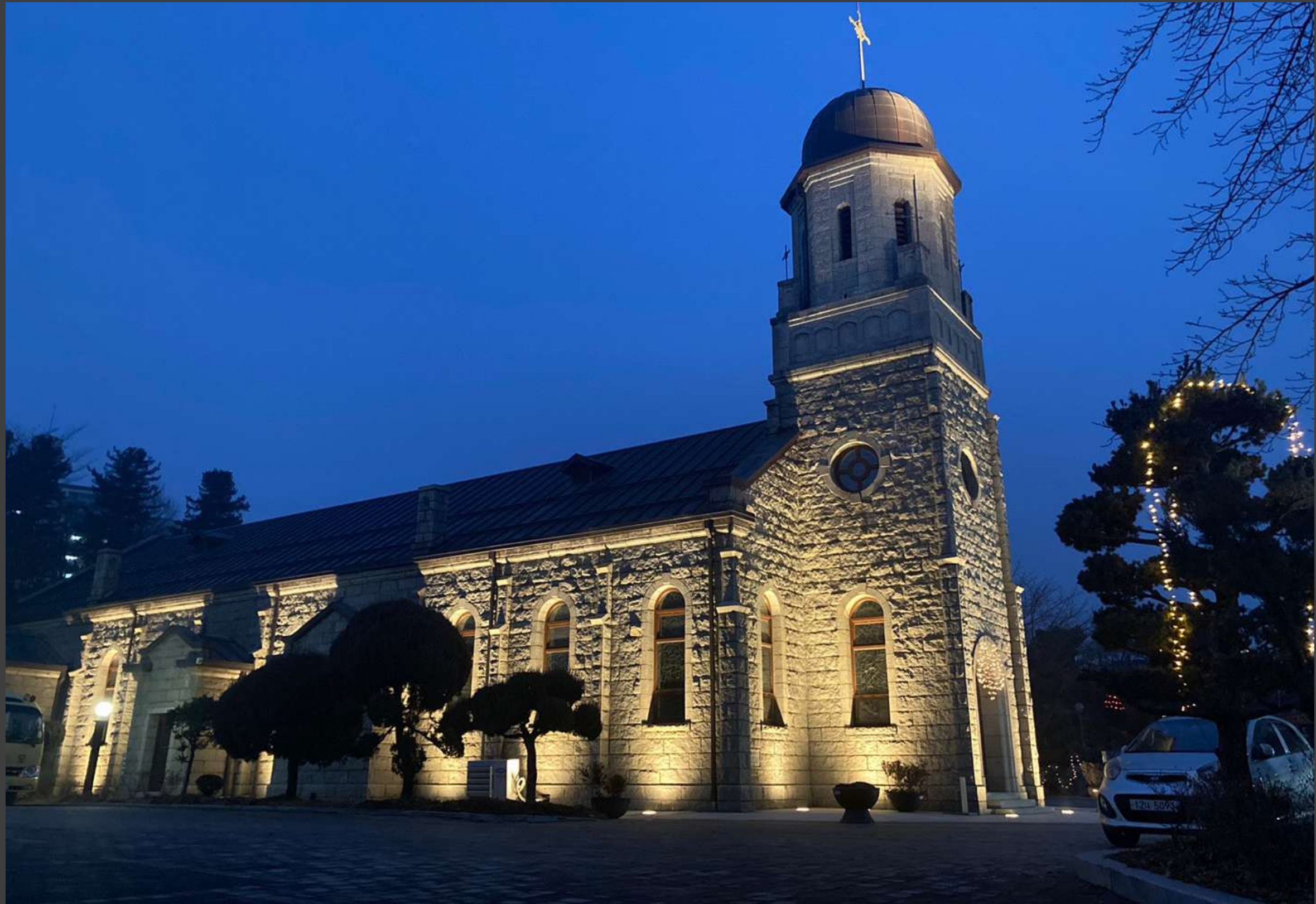
횡성성당, Catholic church ,Hoengseong-gun 적용제품: Nau-SQ