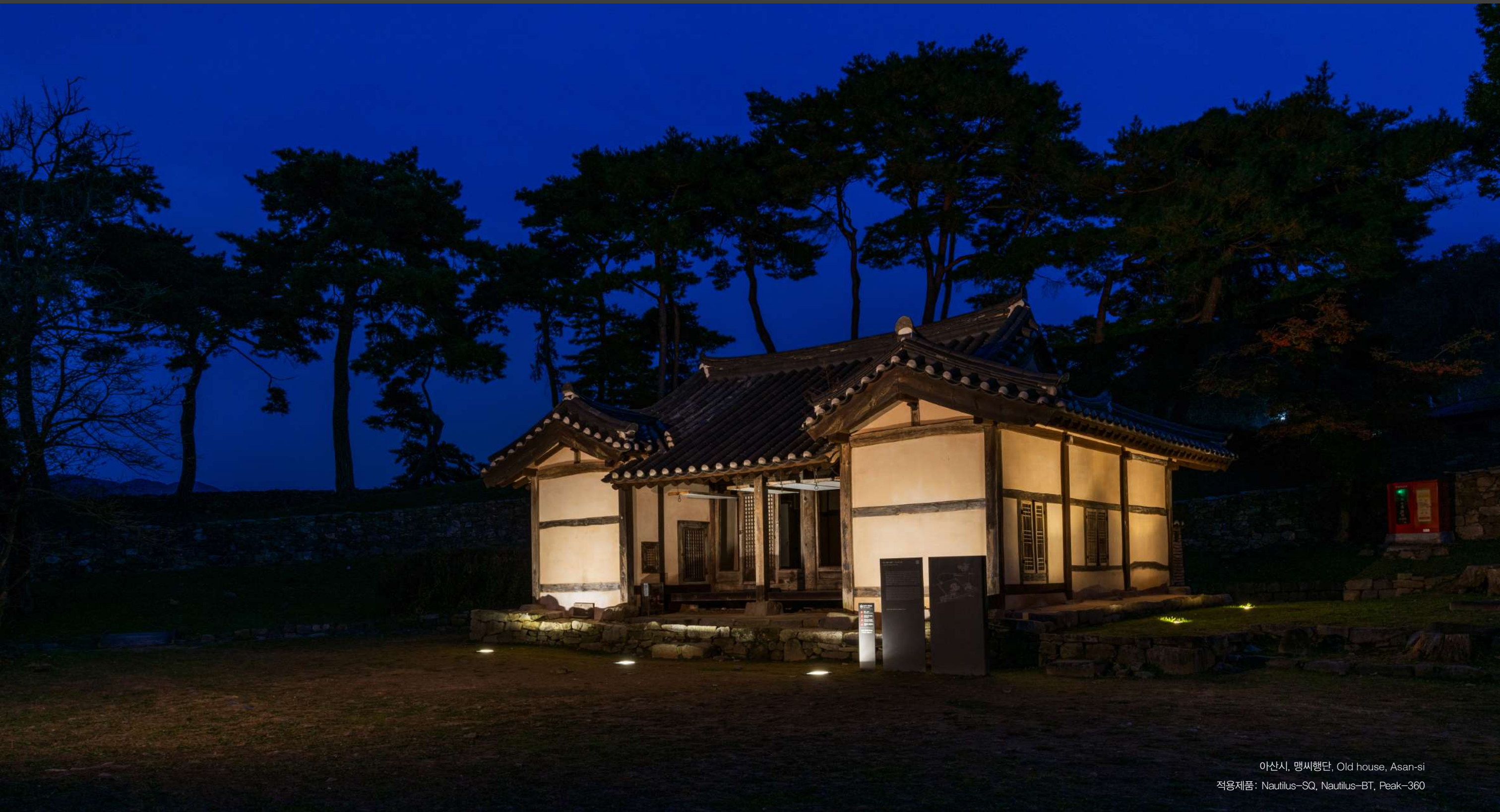
아산시, 맹씨행단, Old house, Asan-si 적용제품: Nautilus-SQ, Nautilus-BT, Peak-360