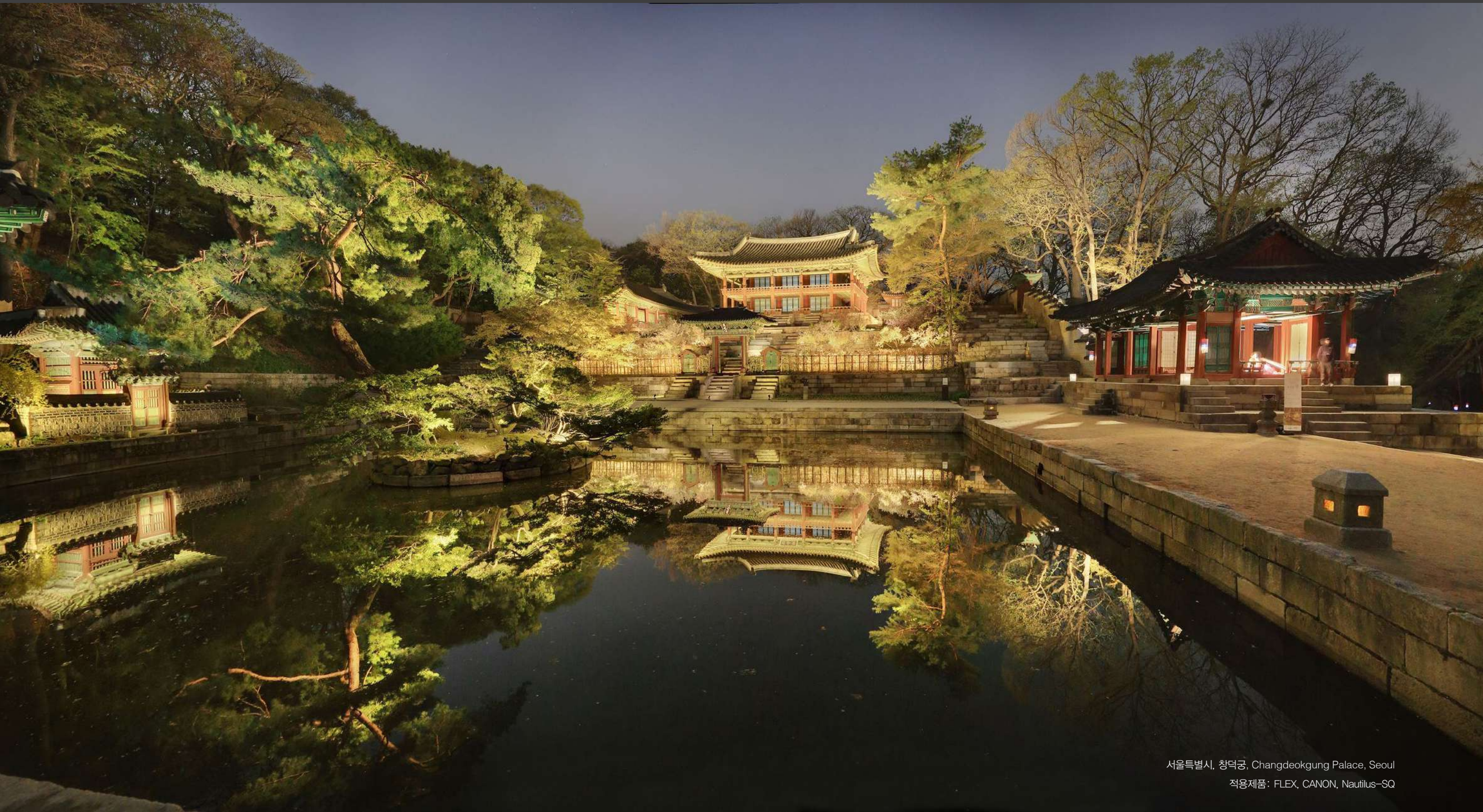
서울특별시, 창덕궁, Changdeokgung Palace, Seoul 적용제품: FLEX, CANON, Nautilus-SQ