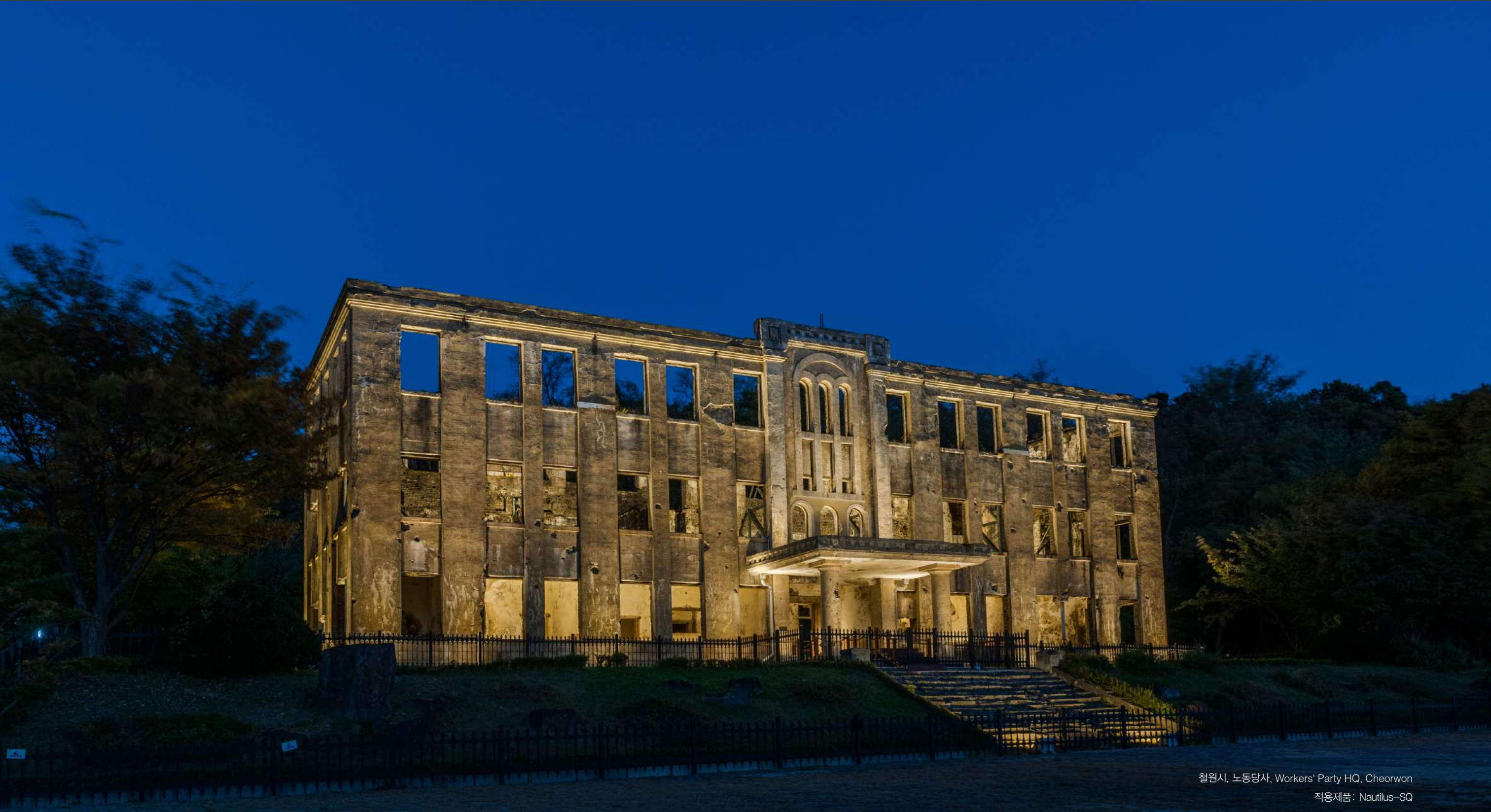
철원시, 노동당사, Workers' Party HQ, Cheorwon 적용제품: Nautilus-SQ