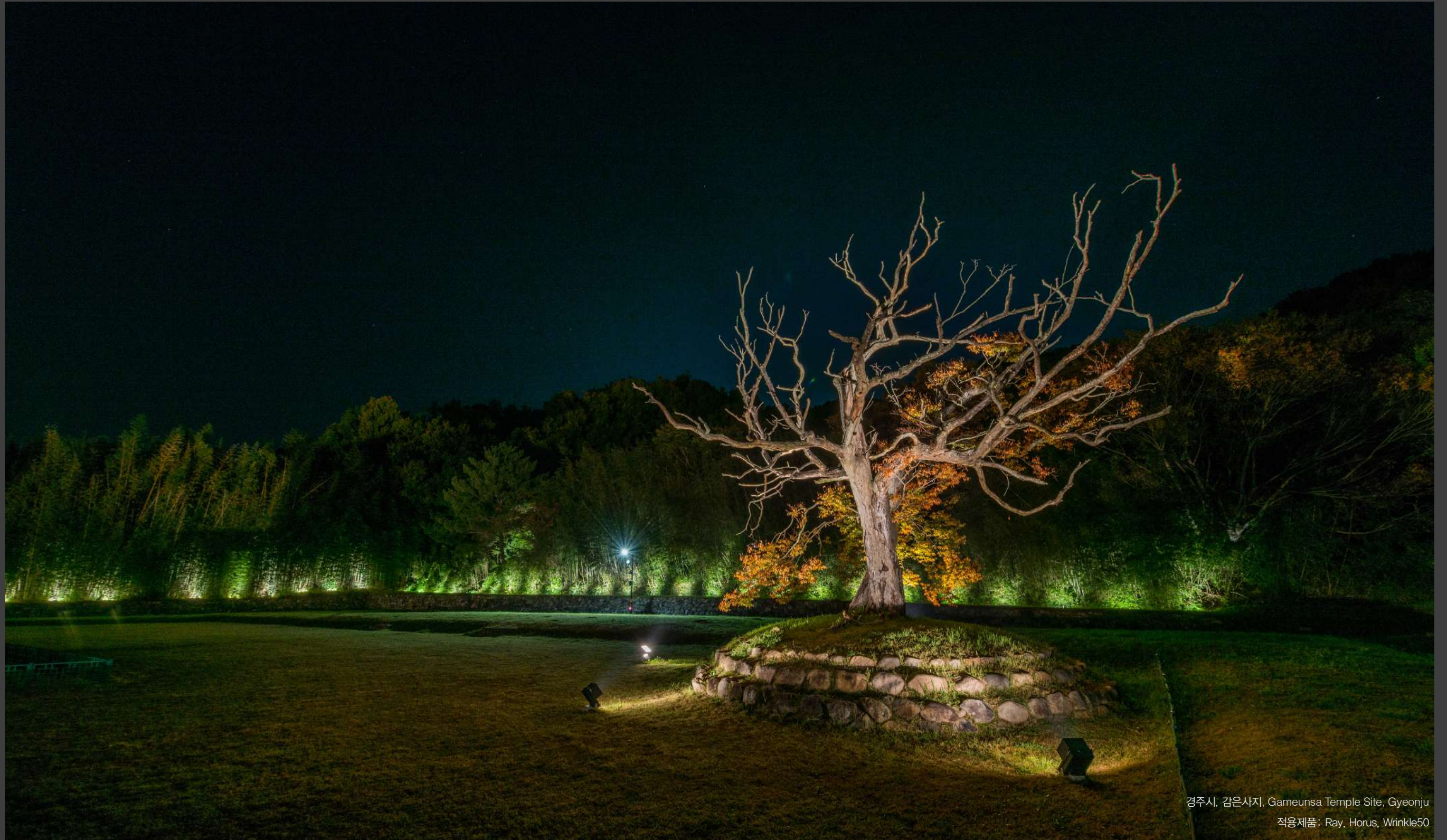
경주시, 감은사지, Gameunsa Temple Site, Gyeongju