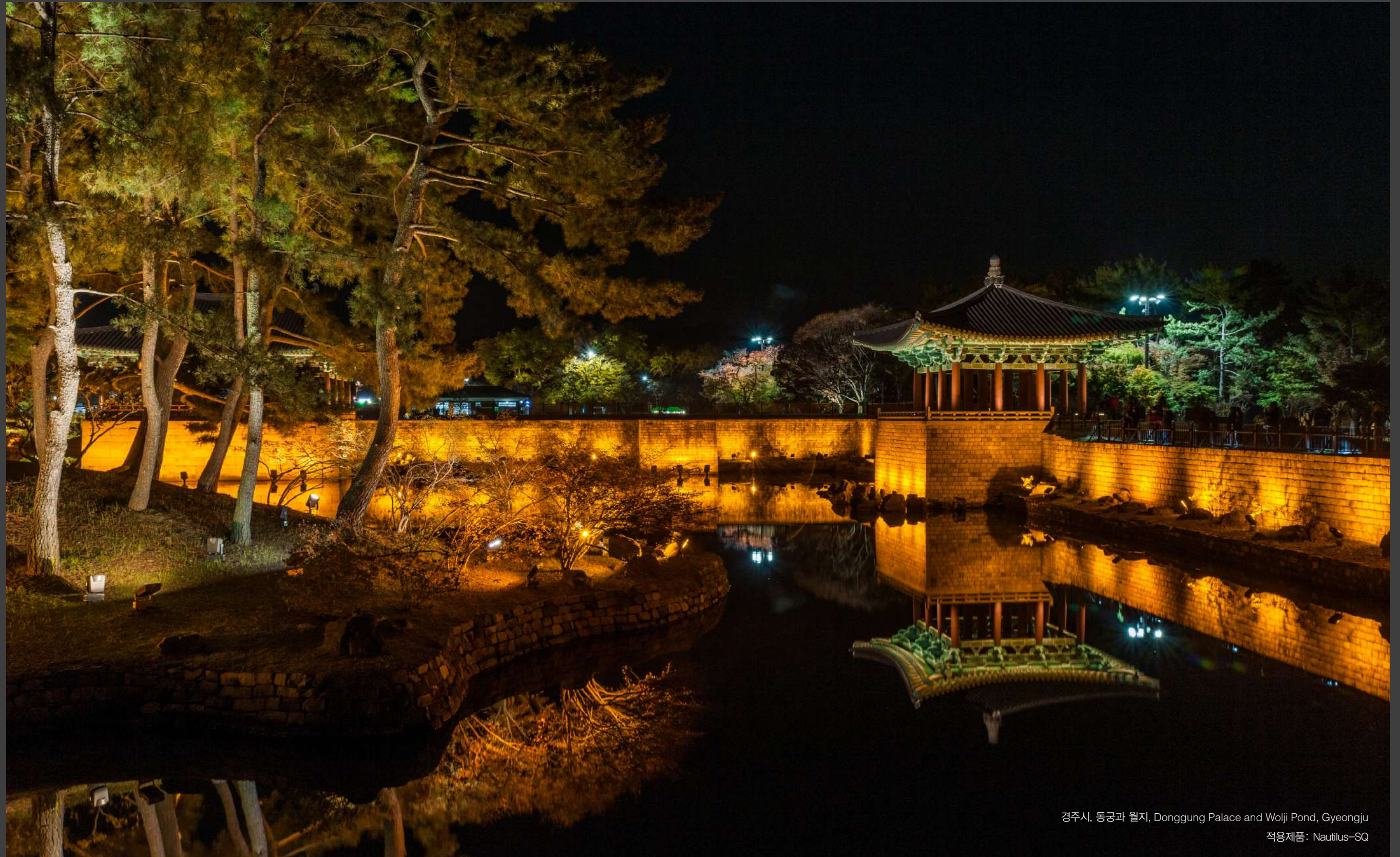
경주시, 동궁과 월지, Donggung Palace and Wolji Pond, Gyeongju 적용제품: Nautilus-SQ