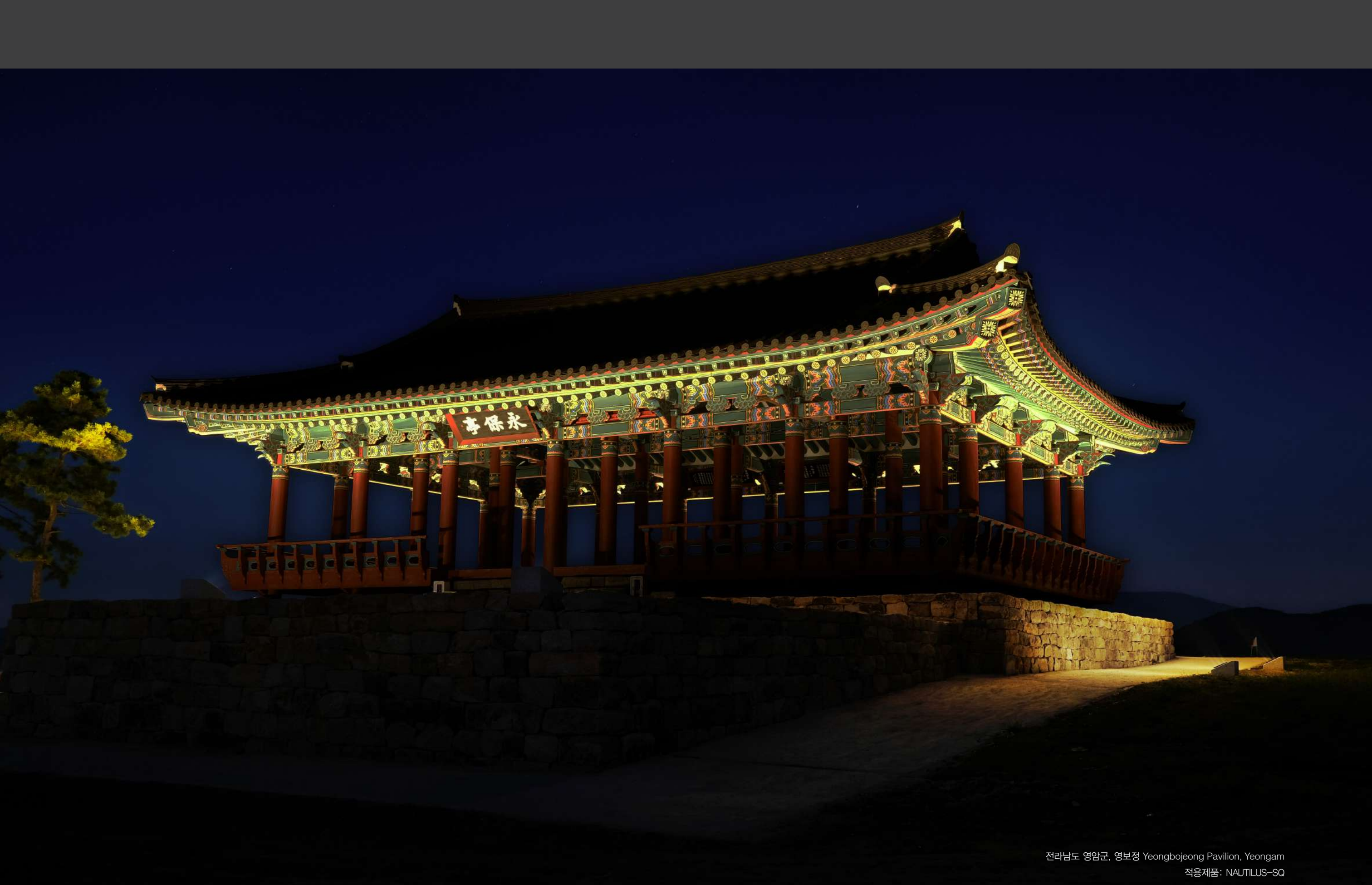
전라남도 영암군, 영보정 Yeongbojeong Pavilion, Yeongam 적용제품: NAUTILUS-SQ