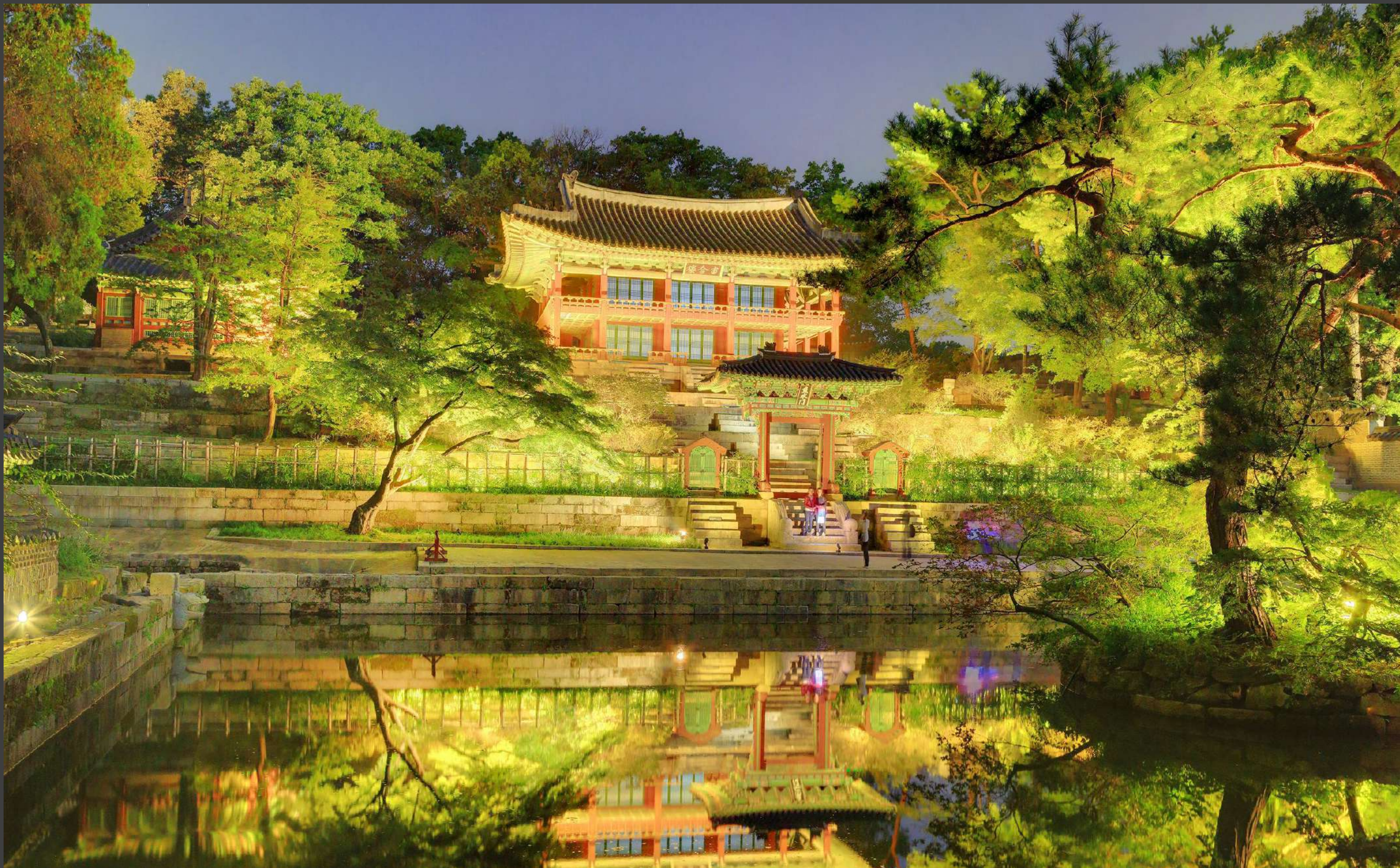
서울특별시, 창덕궁, Changdeokgung Palace, Seoul 적용제품: NAU-SQ, FLEX