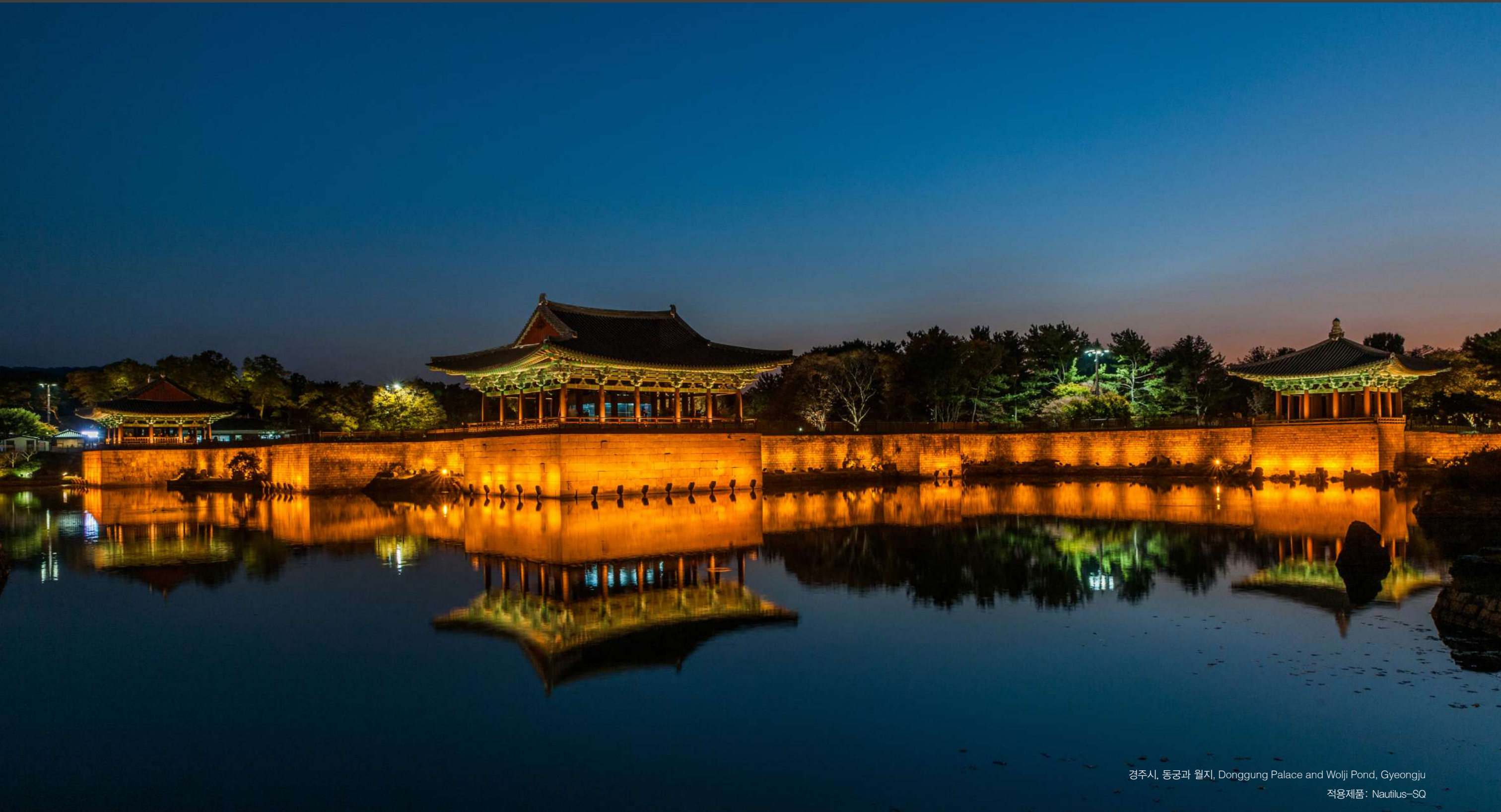
경주시, 동궁과 월지, Donggung Palace and Wolji Pond, Gyeongju