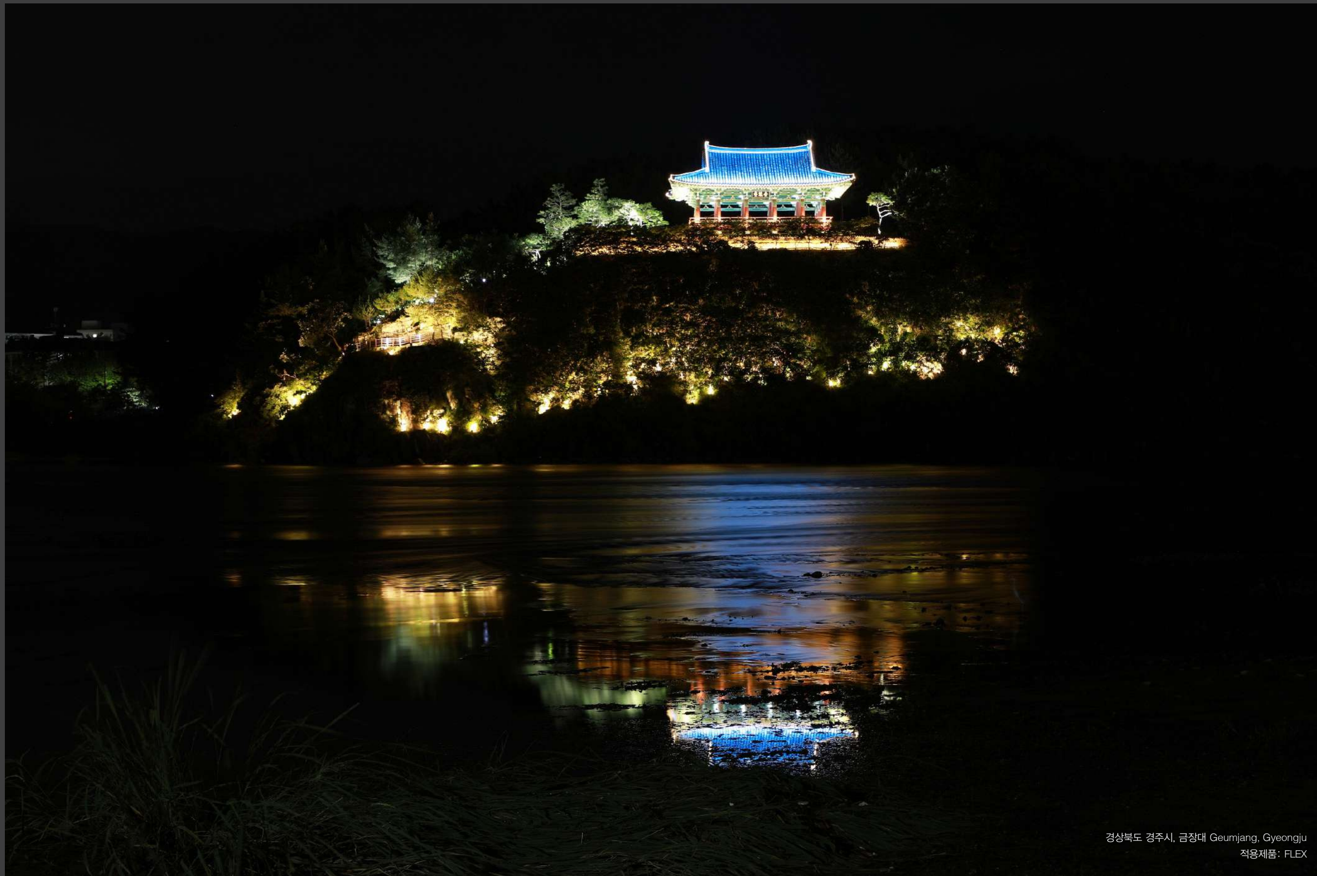
경상북도 경주시, 금장대 Geumjang, Gyeongju 적용제품: FLEX