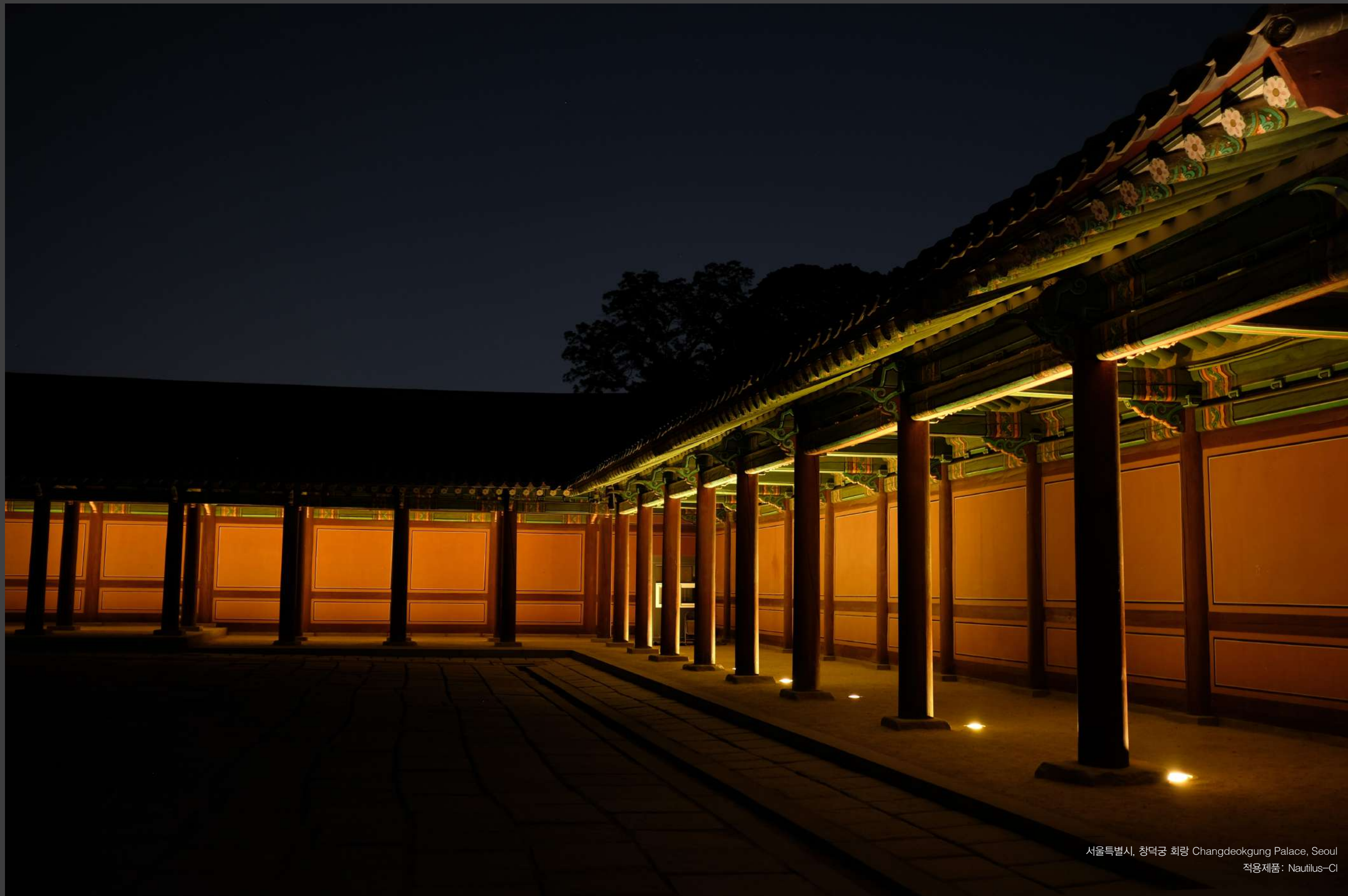
서울특별시, 창덕궁 회랑 Changdeokgung Palace, Seoul 적용제품: Nautilus-Cl