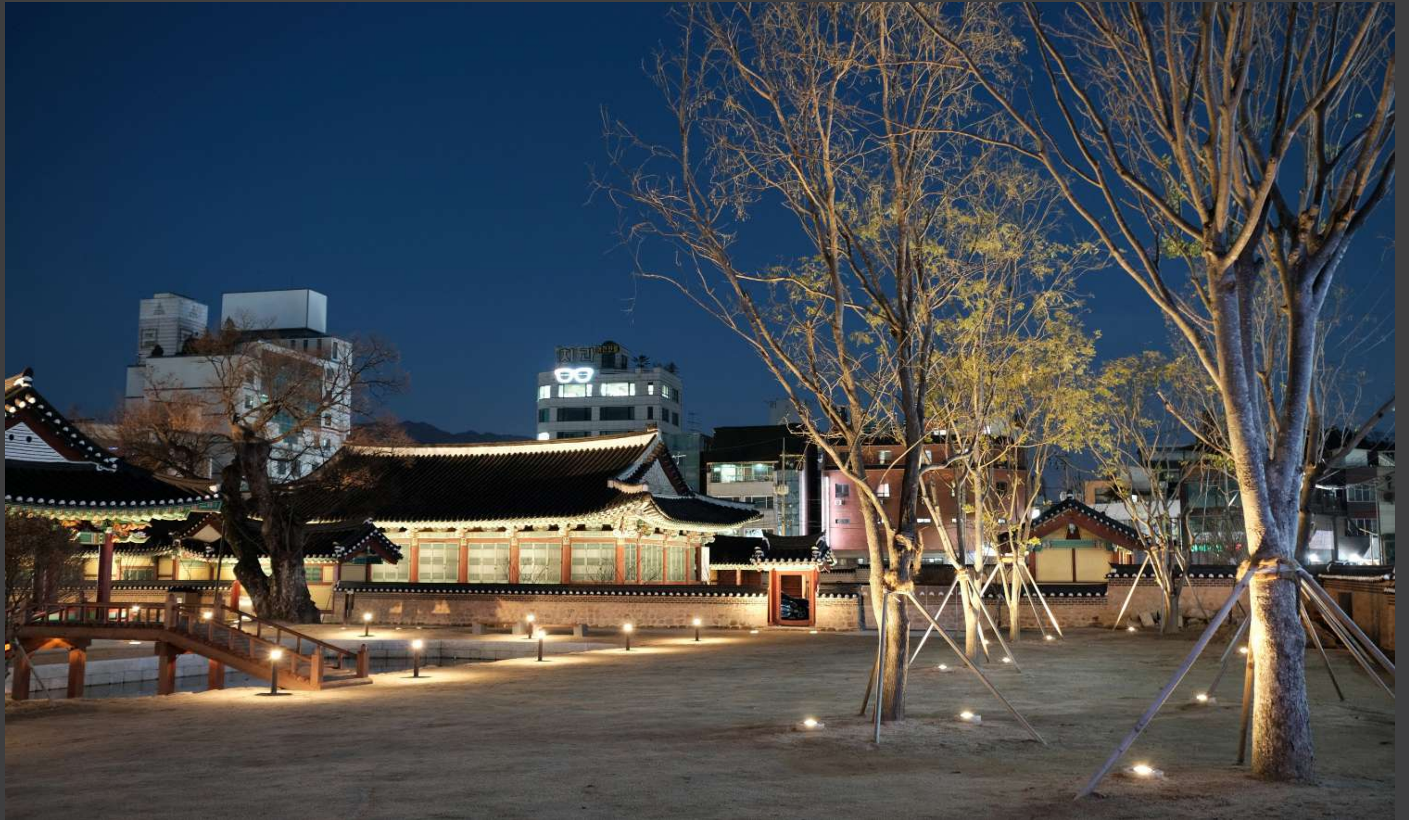
원주 강원감영 Wonju old government office, Wonju 적용제품: Nautilus-BT, WOODY