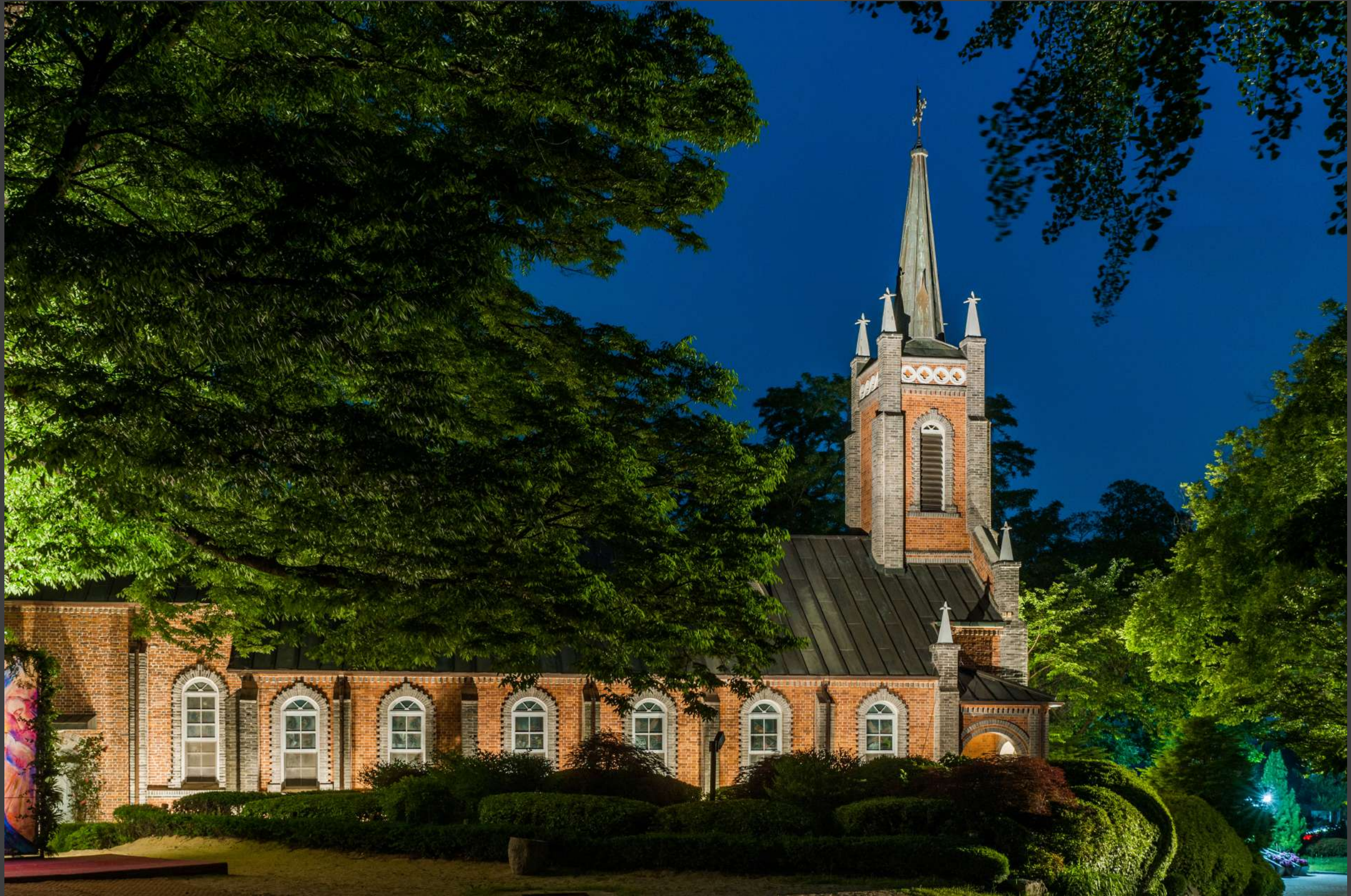
공세리성당, Catholic church, Asan-Si 적용제품: NAU-SQ, FLEX, PEAK, STEM